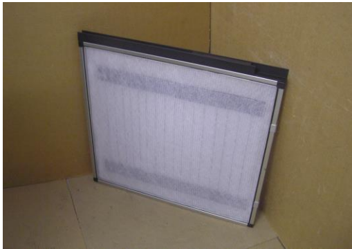
Air Flow vs Resistance